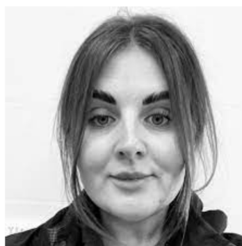
Miss Eddington SVQ 2 & 3: Childcare and Development Nursery Practitioner