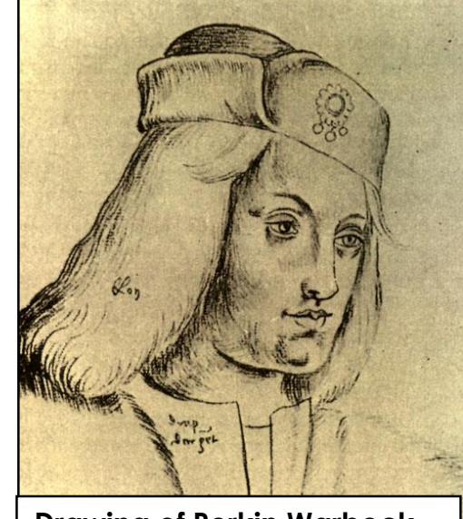
Drawing of Perkin Warbeck