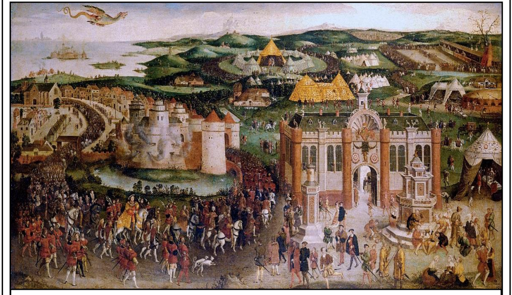
Painting of The Field of the Cloth of Gold